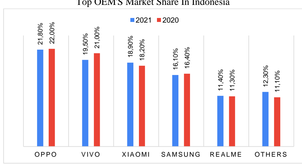
Figure 3 Top OEM'S Market Share In Indonesia

Based on the latest data according to Counterpoint Reasearch , smartphone sales in 2021 increased compared to the previous year. This can be seen in Chart 3 of the Top OEM'S Market Share In Indonesia there is an increase of up to 5% in 2021 which makes 2021 the year when smartphone sales reached their peak. Then there was an increase in smartphone sales online by 18% in 2021.